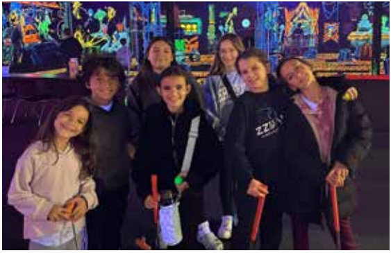
Machar Youth Group had a blast at Monster Golf!