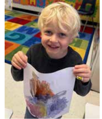
The smiles on our ECC students as they learn, play and grow together, fill our hearts with joy and pride every day!