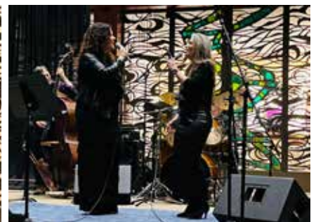
Beautiful evening at our Israel Solidarity Concert with Neshama Carlebach.