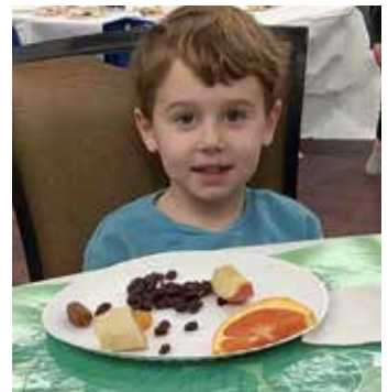
Celebrating Tu B'Shevat!