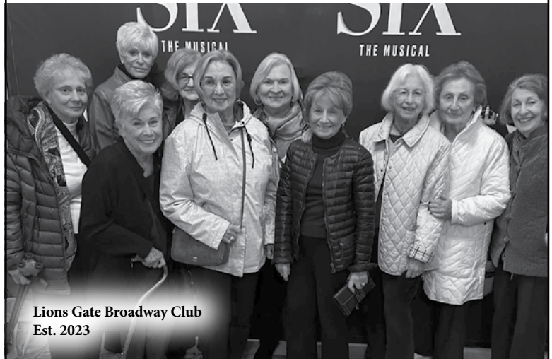
Lions Gate Broadway Club Est. 2023