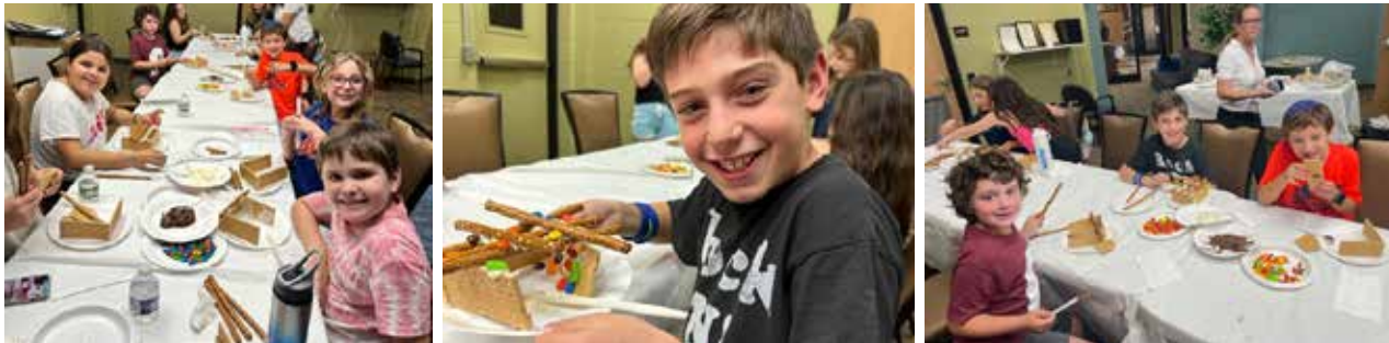
Machar Youth Group had an amazing time making edible Sukkot!