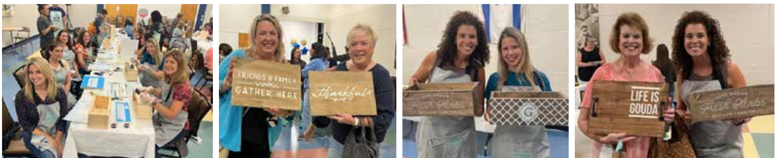
Sisterhood's Kick Off Event with AR Workshop was so much fun. Look at their beautiful creations!