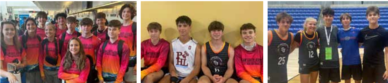
Beth El teens at the Maccabi Games in South Florida.