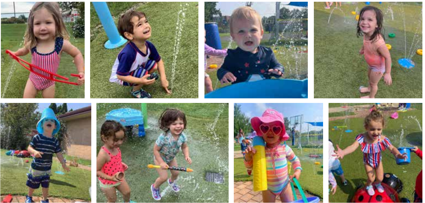
Our adorable ECC students love the Splash Pad!