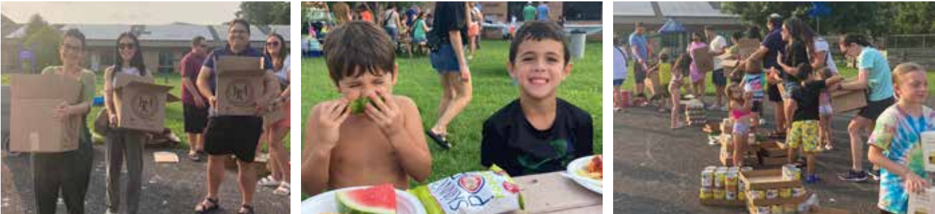
Thank you to everyone who came to our Splash Party. It was wonderful to see so many of our youngest members participate in packing food for people served by the Jewish Relief Agency.