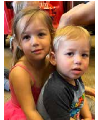
ECC Shabbat Party!