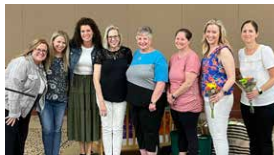
Sisterhood Installation Event