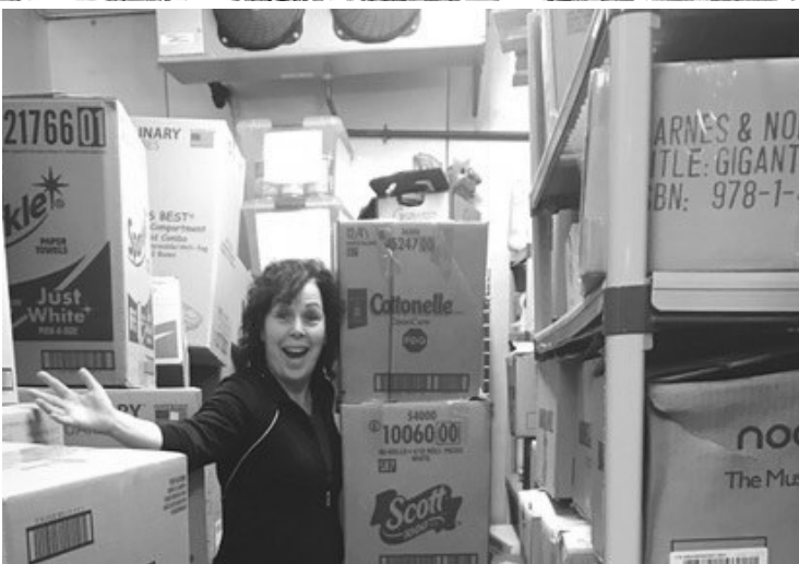
A big thank you everyone who spent the morning helping others with our 4th Annual Community Mitzvah Day!