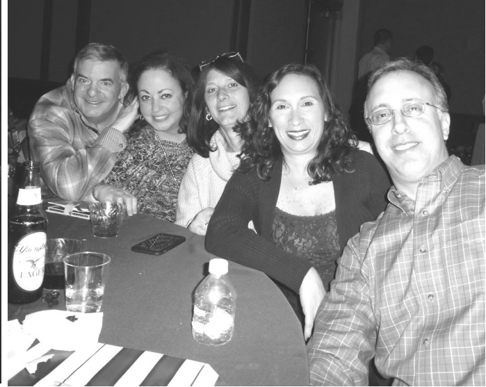
Over 450 people danced, sang, and enjoyed Dueling Pianos!