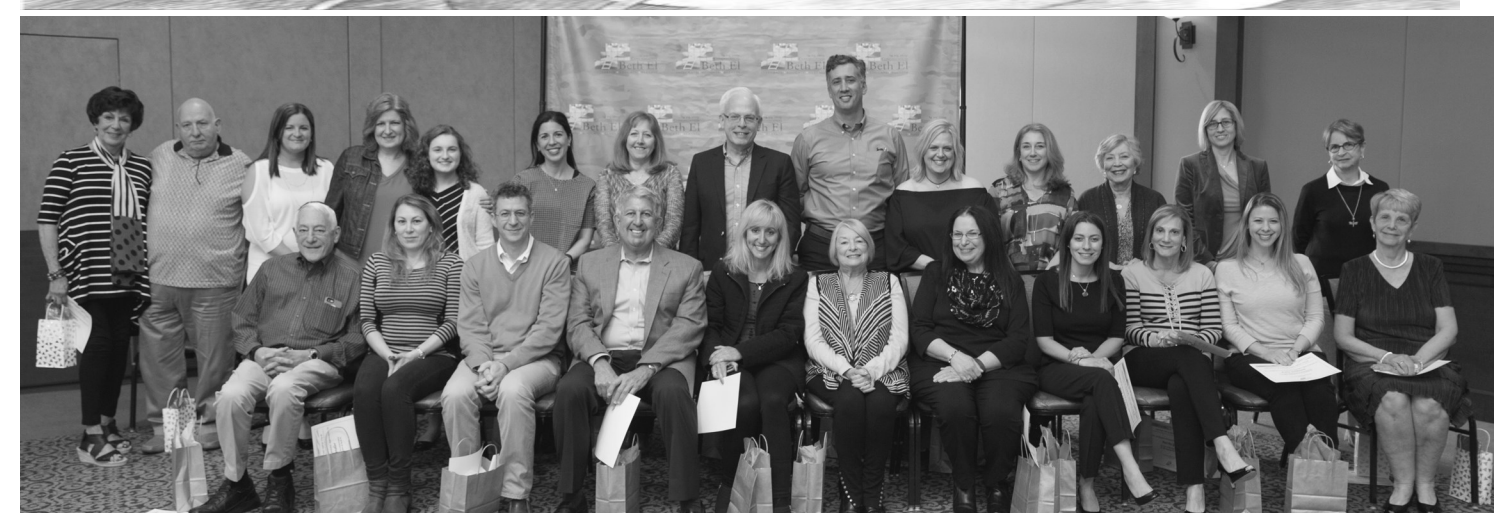
2017 Annual Meeting Honorees