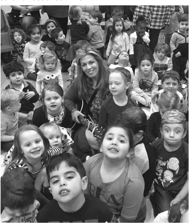
CONGRATULATIONS TO HAZZAN FROM THE ECC FAMILY.

We collected over $600.00 in Tzedakah money, some of which we donated to the Animal Shelter and with some we bought winter gear for children in poor neighborhoods. With the help of our ECC families we shipped three suitcases with shoes to children in Uganda. Our Kindergarten class went twice this year to the Lion's Gate to visit with their residence and celebrate holidays with them.