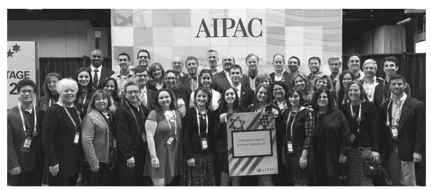
Our Beth El members and students at AIPAC Policy Convention in Washington, DC