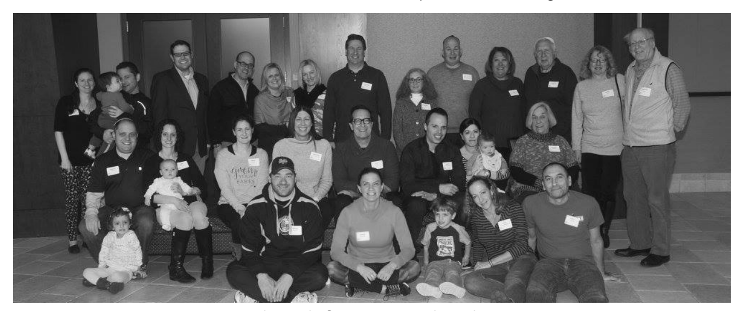
Our newest members at the first ever New Member Welcoming Ceremony