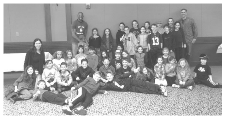
Members of the Shabbat Shalom Club