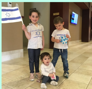
On May 9 we celebrated Yom HaAtzmaut, Israel's Independence Day, at Café 71: Saluting Innovation Israel!