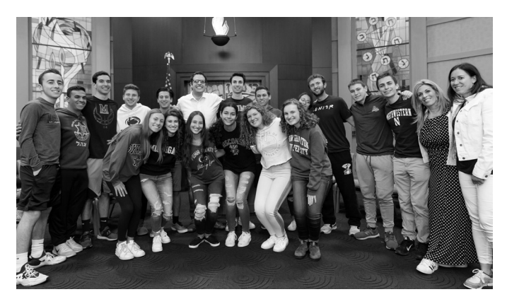
Senior Sendoff 2019

Many of our graduating seniors attended this special ceremony with our cleray!