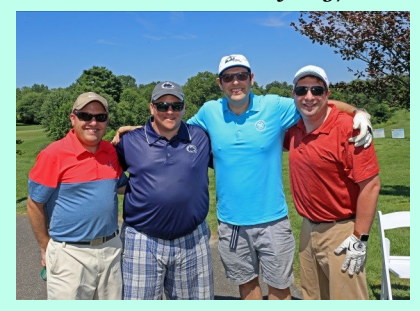
Our 2nd Annual Golf Classic & Game Day at Woodcrest Country Club included more than 100 golfers, gamers and friends!