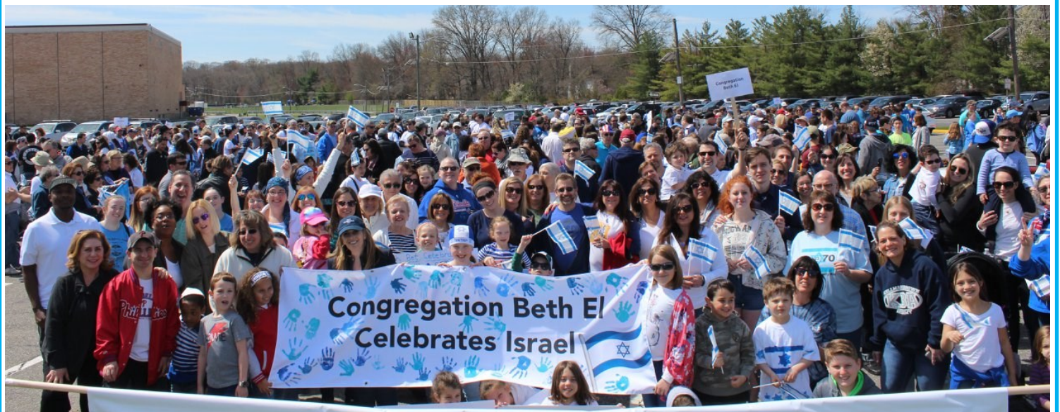
Congregation Beth El showed our love for Israel during the community Israel at 70 parade