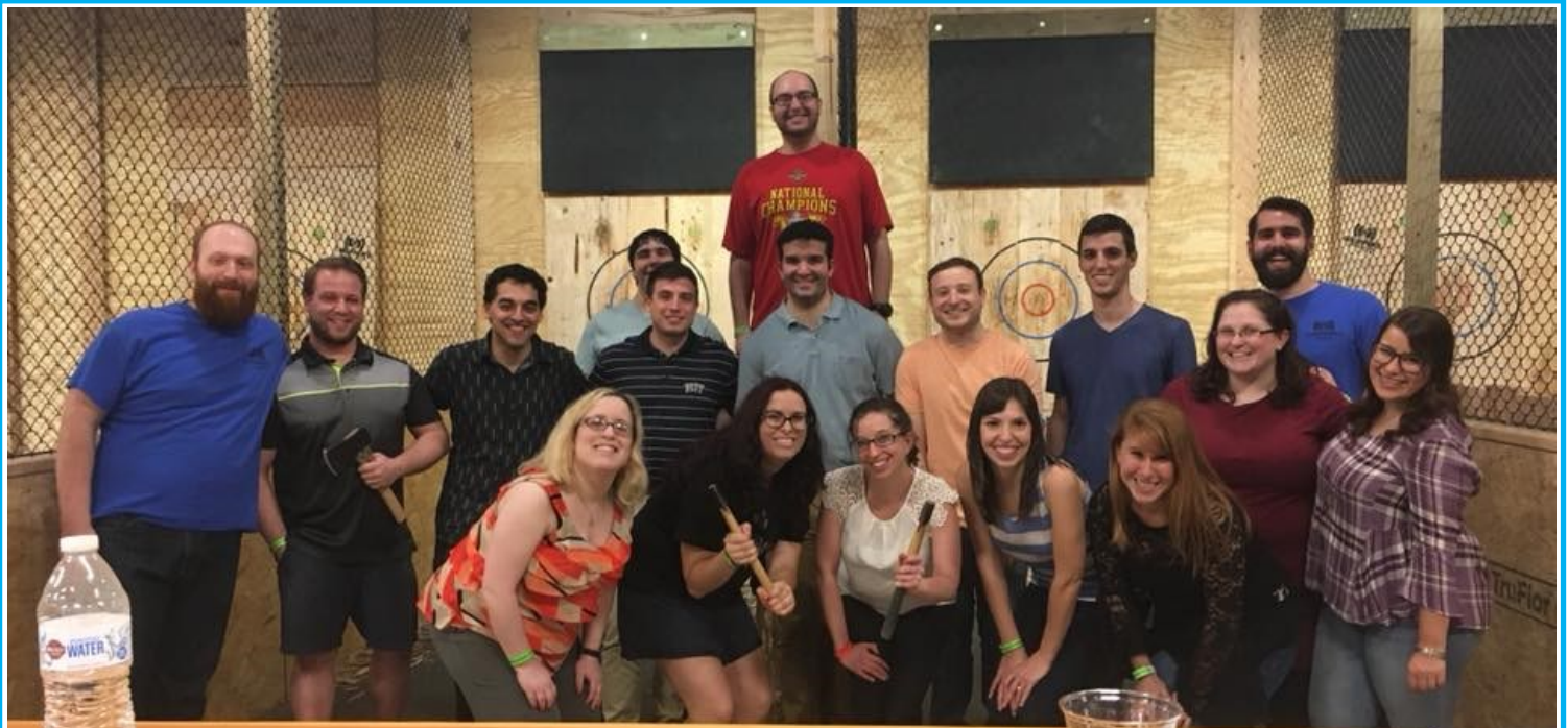
YoPro Goes Axe Throwing was a huge success with over 14 young professionals coming together for a night of fun at Choppers Hatchet House!