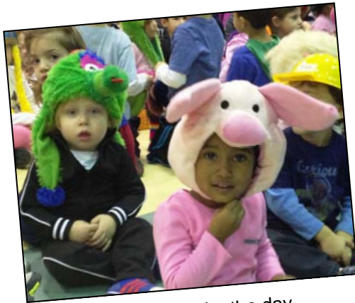
We wore silly hats for the day . . .