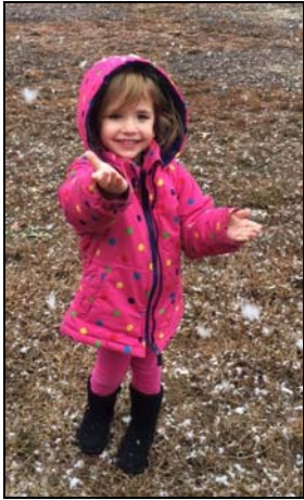
We played in the snow, over and over and over