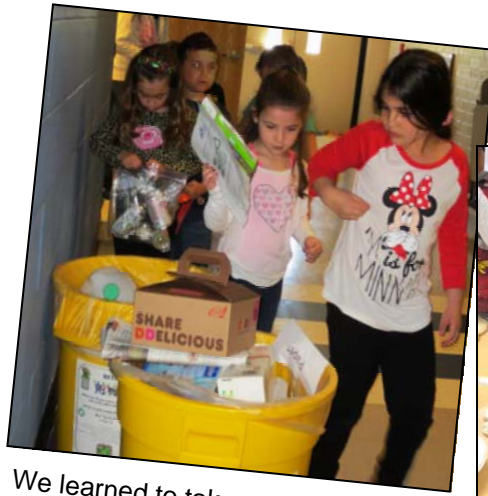
We learned to take care of our planet by recycling . . .