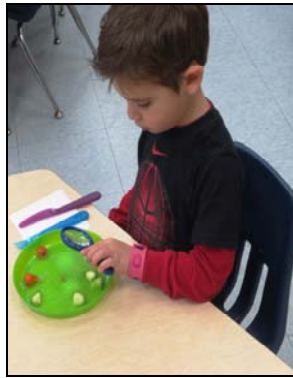
We investigated our food, the growing and harvesting seasons, how plants grow, but mostly how they taste.