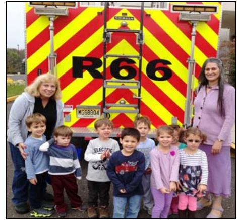
The firefighters made our day with a visit to the school