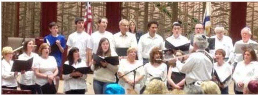
Beth El Adult Choir performing at Café 66