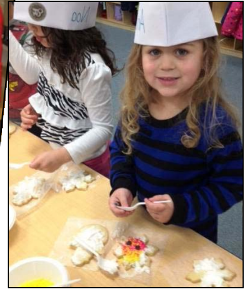
. . . and how to decorate delicious treats.