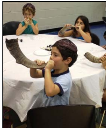
. . . and made shofars that we could really blow.